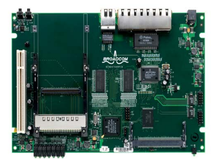
AP/Router Reference Design