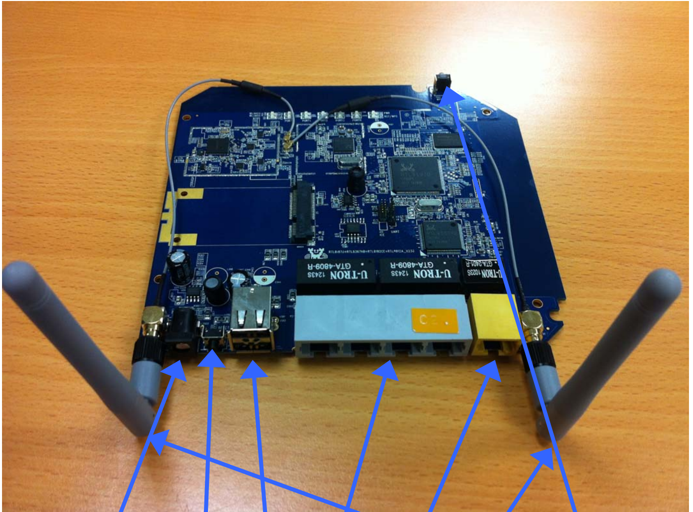
Power Jack, Reset button, USB, LAN, WAN, Antenna, WPS button