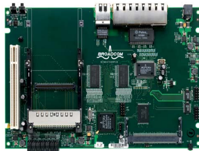
AP/Router Reference Design